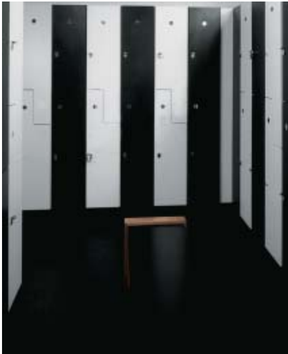
Larry North – Model Z, Plastic Laminate Door