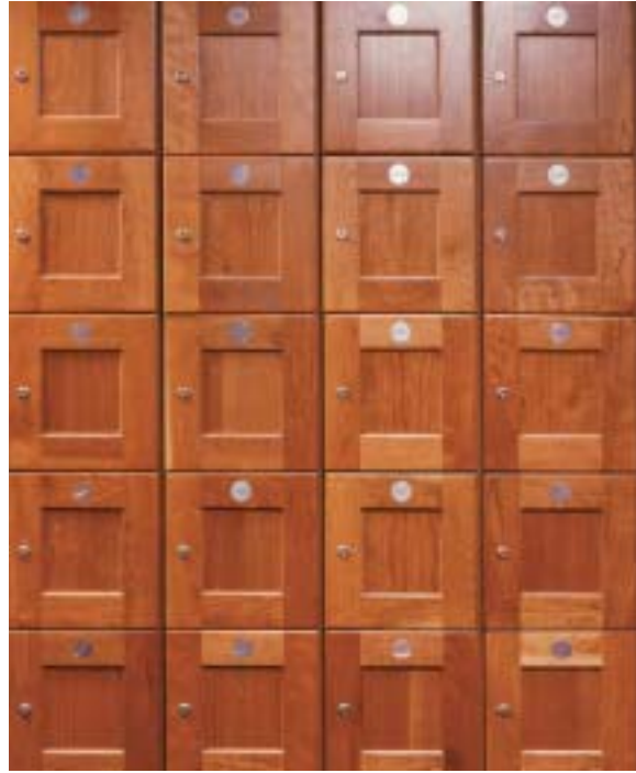
The Fitness Company – Model F, Cherry, Flat Panel Door