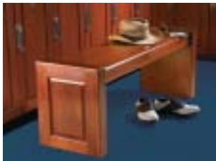
TRADITIONAL BENCH (VENEER SEAT)