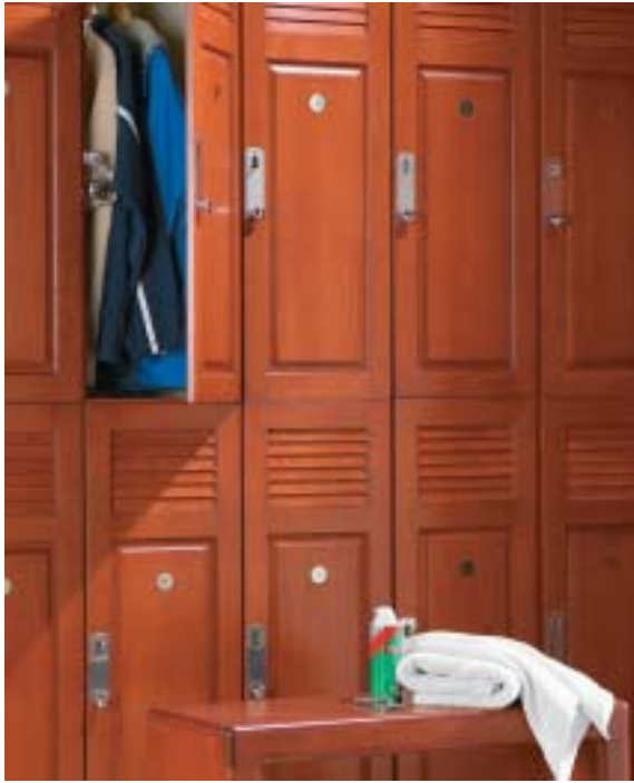
LA Fitness – Model B, Cherry, Raised Panel Door with Louver