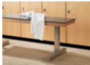
FLAT BENCH (SOLID SURFACE TOP)