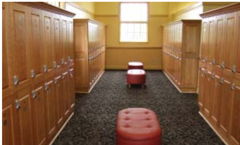
Portland Golf Club – Model B, Cherry, Raised Panel Door with Keyless Security Lock

For over two decades, Hollman, Inc. has developed a reputation for building lockers that excel in every area – from detailed craftsmanship and innovative designs to their unparalleled durability. Our uncompromising standards have led the nation’s top-ranking country clubs, fitness centers, professional sports franchises, spas, and corporations to enhance their images with their selection of Hollman Luxury Lockers. The Dallas-based 300,000 square-foot facility contains the most technologically advanced machinery and systems available in the industry. Every Hollman wood door is milled and cut with exacting precision using computer-guided equipment; guaranteeing unparalleled consistency throughout the entire process. Furthering our commitment to quality assurance is our recent multimillion dollar investment in the Cefla UV finish line that produces a furniture-quality clear-coat finish. The UV (ultra violet cured) clear coat provides the highest achievable level of durability in a wood finish while also enhancing the wood’s natural colors and unique grain patterns. At Hollman we strive for excellence and we deliver it.