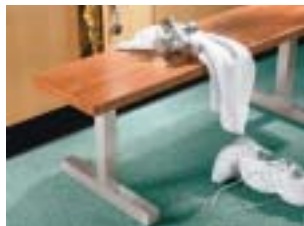
BUTCHER BLOCK BENCH