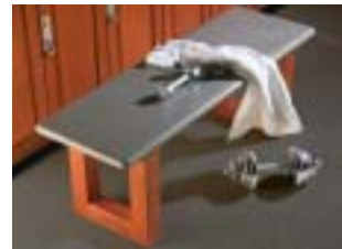
SOLID SURFACE BENCH