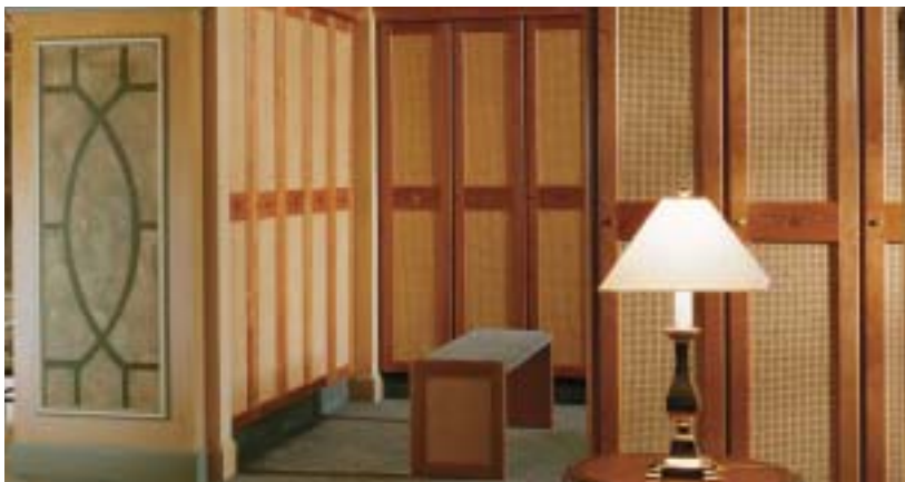
Pumpkin Ridge Golf Club - Model A, Maple, Flat Panel Door with Cane Insert

Hollman's luxury line of lockers can be found in many of the nation's most prestigious country clubs and resorts, including Pebble Beach, and Baltusrol. But you don't have to be host of a PGA event to enjoy our lockers. We offer a locker system to fit every style and budget, featuring the exquisite detailing you would expect from fine furniture, yet built to endure high-traffic, high-humidity environments. Hollman's turn-key process includes everything from conceptual design to final installation. And we can install your entire locker system in as little as three to four days. Superior craftsmanship, unprecedented quality and outstanding customer service make Hollman Luxury Lockers an excellent investment.