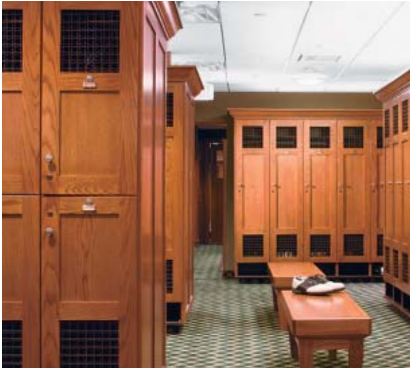
Baltusrol Golf Club - Model A & B, White Oak, Shaker Door with Custom Insert