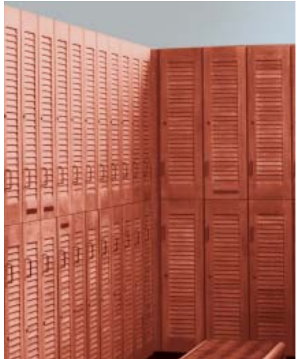
Model B, Maple, Louver Door