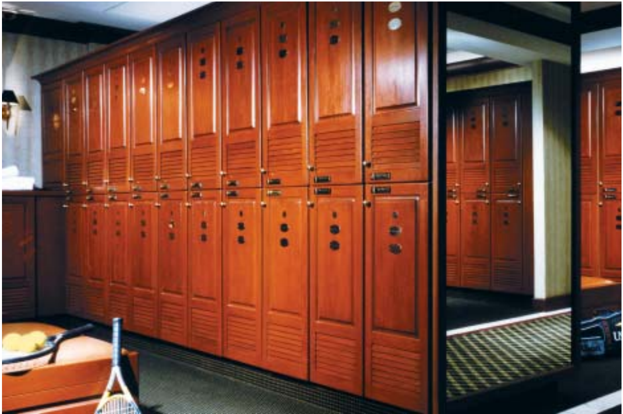
Cherokee Town Club – Model B, Mahogany, Raised Panel Door with Louver