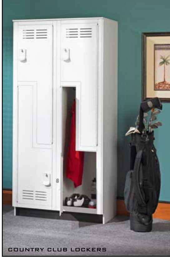
COUNTRY CLUB LOCKERS