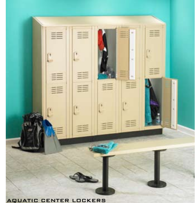
AQUATIC CENTER LOCKERS